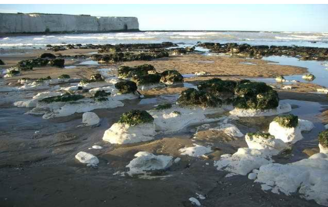
Thanet Coast (UK) N2000 management plan