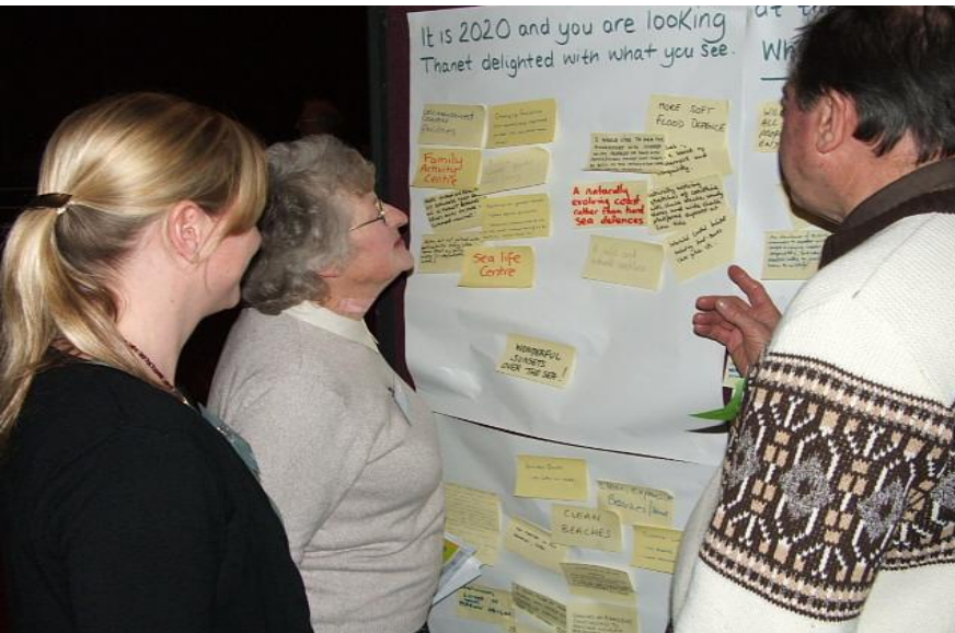
Thanet Coast England - Ecosystem Approach