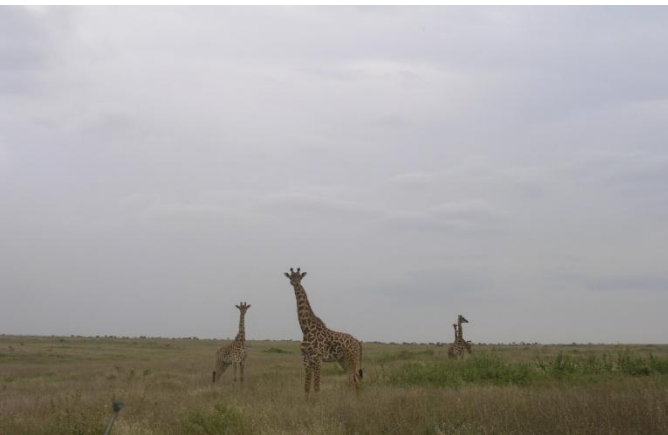
Africa – resource management