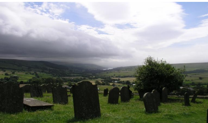
England - Sustainable Upland Management.