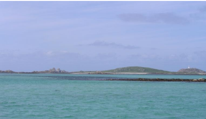
Isle of Scilly England – Integrated landscape management