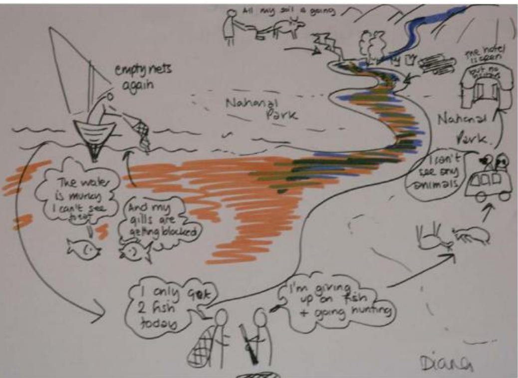
Africa – systems thinking - integrated river basin management