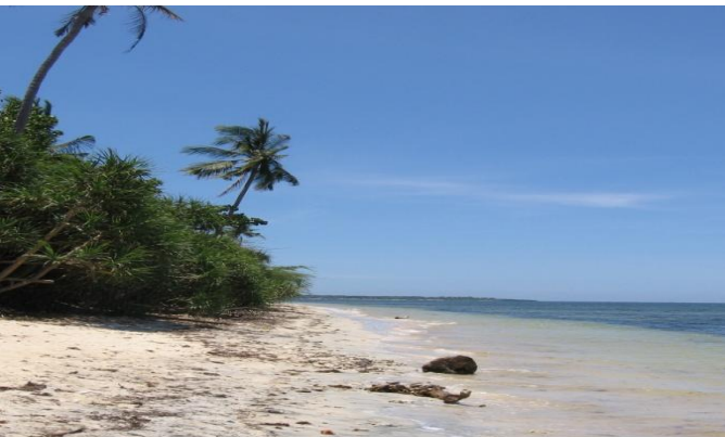
Philippines - Marine Protected Area