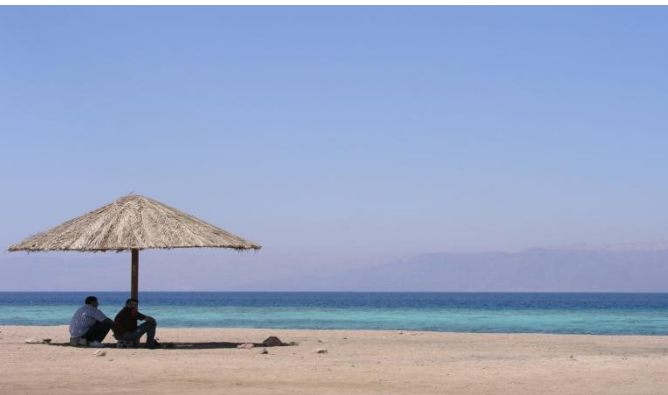
Conservation of the Red Sea and Gulf of Aden