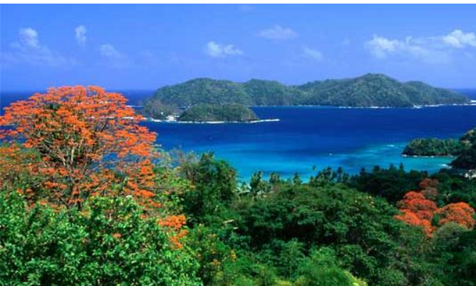
Trinidad & Tabago – National Park management planning