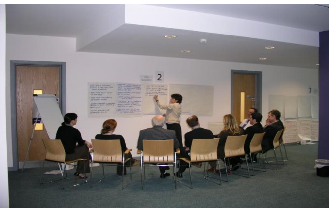
Trinidad and N Wales – similar approach